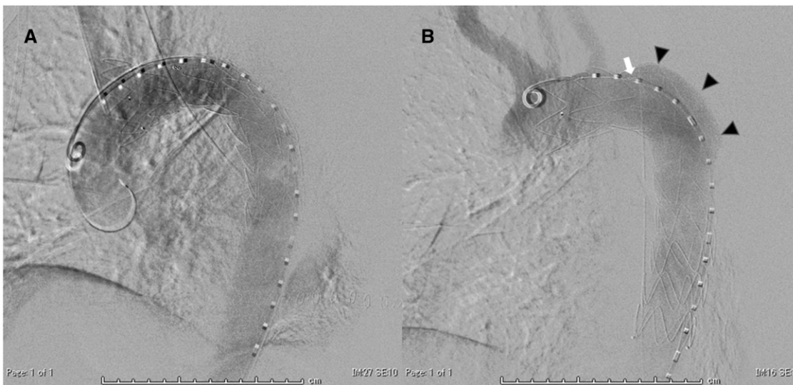
Figure 2: Digital subtraction angiography in thoracic endovascular aortic repair (TEVAR) and re-TEVAR. (A) After the first TEVAR. (B) Before re-TEVAR. Migration of the stent graft was confirmed compared to after the first TEVAR (arrowheads). The marker (white arrow) of the distal end of a fenestration also moved close to free space of the left chest cavity.

performed to prevent further stent-graft migration and impending lethal haemorrhage, although the initially preserved left subclavian artery was intentionally covered. The patient had a haemodynamically stable postoperative course. He was discharged on the 28th postoperative day and was doing well at the 3-month postoperative follow-up.